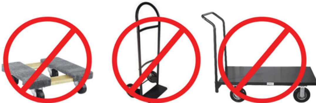
Four wheel push carts