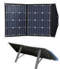
2x35W,2x40W Foldable Solar Panel