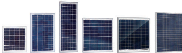
15w, 25w, 35w, 50w, 60w, 100w Poly