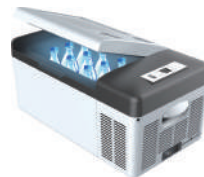
Car Fridge/Freezer 15L