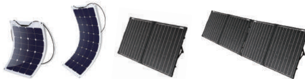
55W 110W 60W,100W 220W