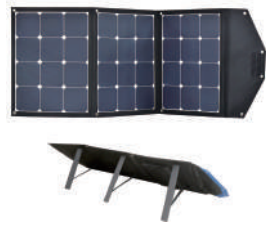
3x35W,3x40W Foldable Solar Panel