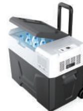
Outdoor Fridge/Freezer 30/40/50L