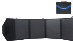
4x12.5W Foldable Solar Panel