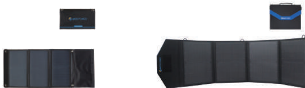
3x7W Foldable Solar Panel